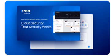
Orca Security Platform Overview