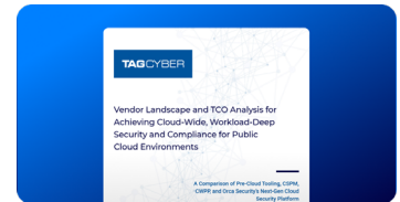
TAG Cyber Report